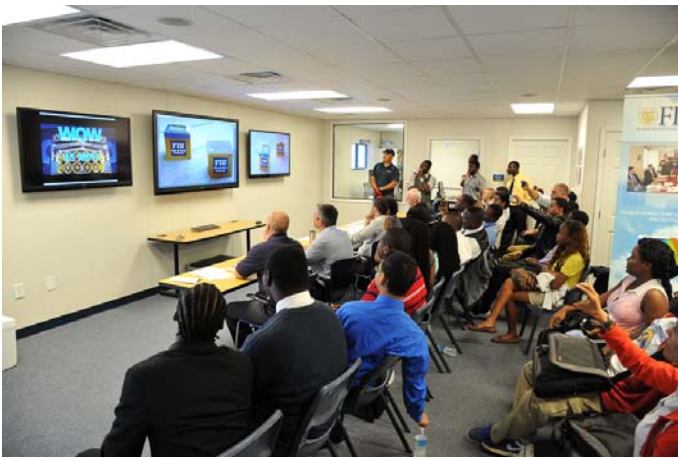
Judges and students observing a physical test.