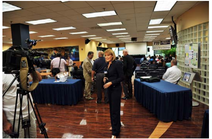
Media coverage of Wall of Wind Challenge