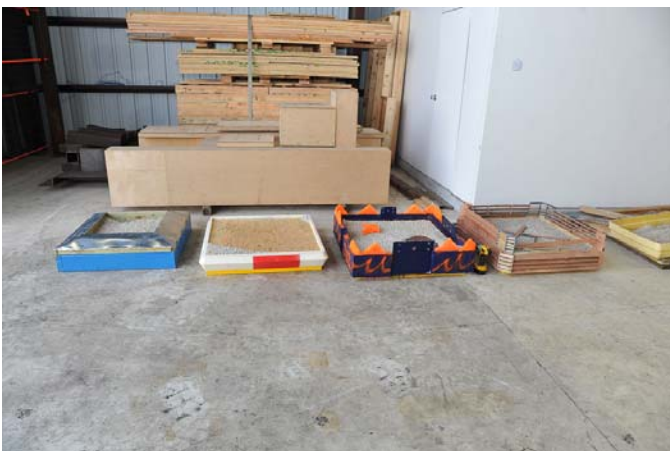
WOW Challenge rooftop models.