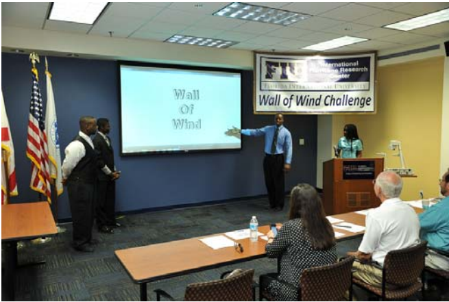
Student Team giving their oral presentation.