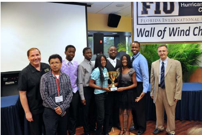
2nd Place Team - North Miami Senior High School