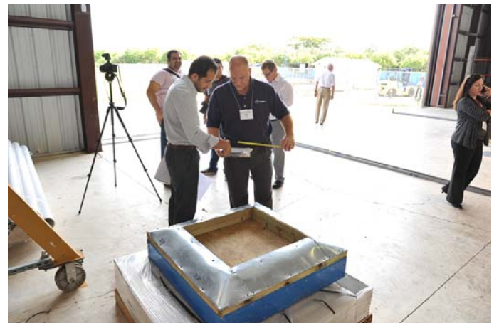
Judges scoring another rooftop model.