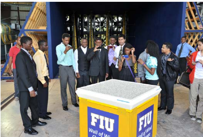
Student team taking pictures of their rooftop.