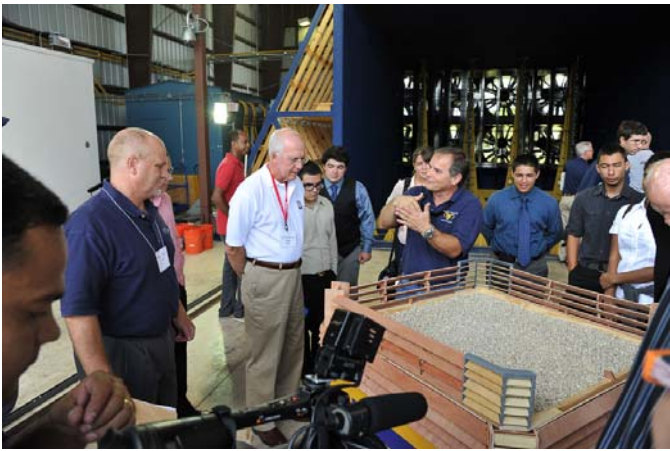
Discussion between Judges and student team.