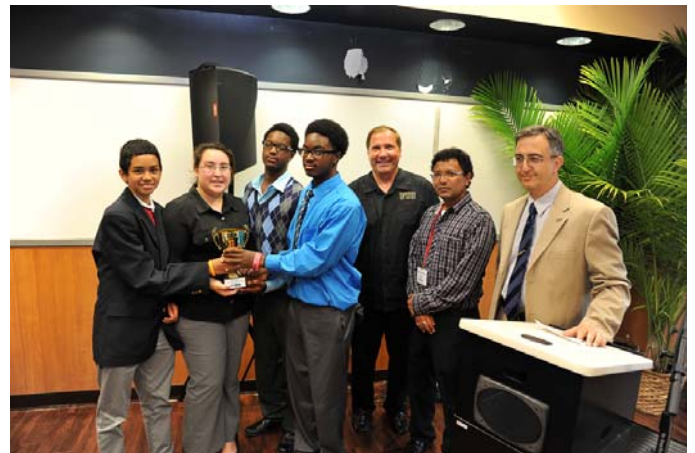
3rd Place Team - Booker T. Washington High School