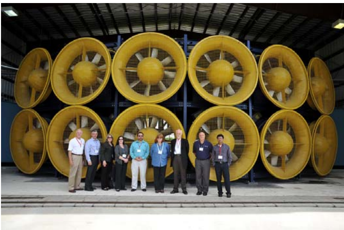
Judges in front of the Wall of Wind.