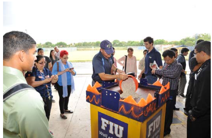
Pouring gravel on rooftop model for next test.