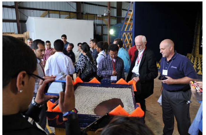
Judges scoring a rooftop model.