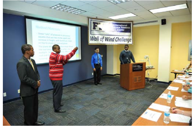
Another student team giving their oral presentation.