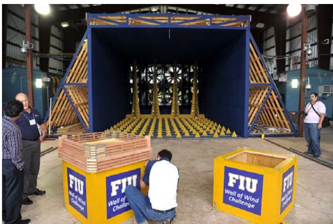
Switching out rooftop building models for next test.