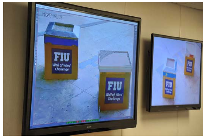
Live viewing in the Operations & Control Center.