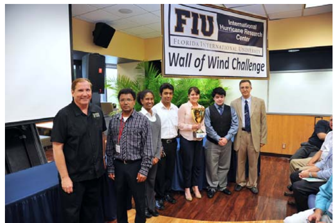
1st Place Team - Miami Coral Park Senior HS