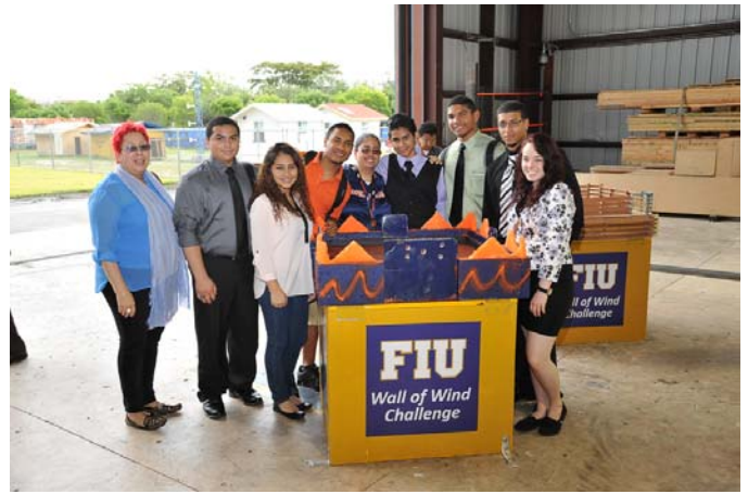
Student team with their rooftop building model.